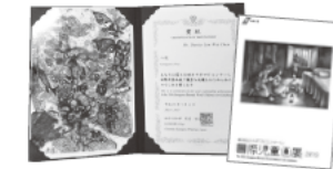
Certificate and Collection Book 20th Edition, 2019

Venue Cultural facilities in Kanagawa Prefecture