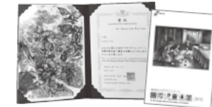
Certificate and Collection Book 20th Edition, 2019

Venue Cultural facilities in Kanagawa Prefecture