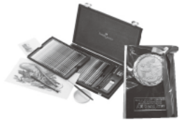
Gift (painting tool and shield) 20th Edition, 2019