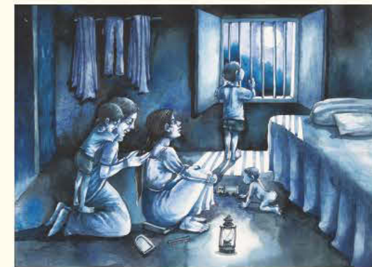
The 20th Grand Prize (2019) Moonlight Chyanika Das 11yrs. India

Numerous pictures will be sent from all over the world. "Let's be friends, with children around the world through the art."