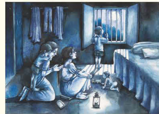
The 20th Grand Prize (2019) Moonlight Chyanika Das 11yrs. India

Numerous pictures will be sent from all over the world. "Let's be friends, with children around the world through the art."