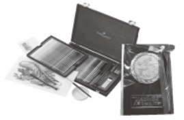
Gift (painting tool and shield) 20th Edition, 2019